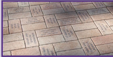
4x8 Engraved walkway bricks—$150/brick